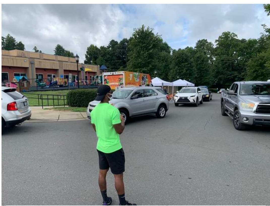
A volunteer directs traffic entering the CWWCHC's 6<sup>th</sup> annual Community Health Fair.