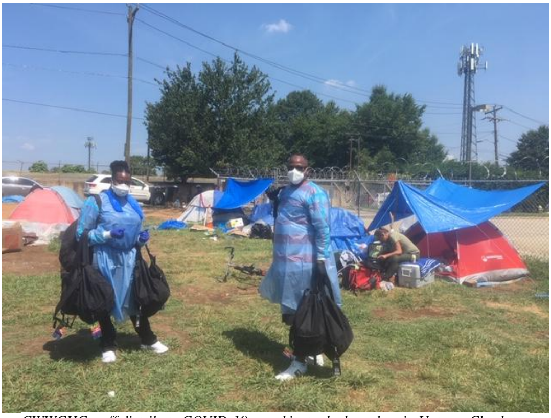
CWWCHC staff distribute COVID-19 care kits to the homeless in Uptown Charlotte.