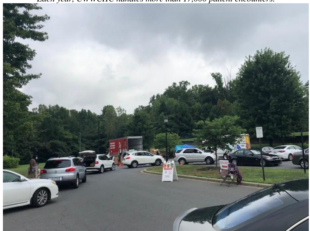
Cars line up to visit vendor booths and receive COVID-19 testing.

Each year, CWWCHC handles more than 17,000 patient encounters.