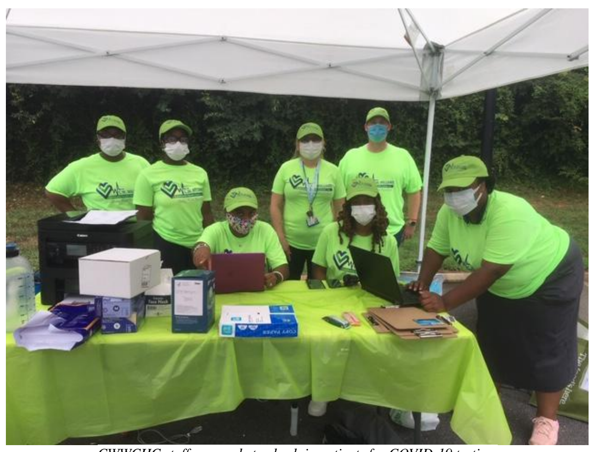
CWWCHC staff are ready to check-in patients for COVID-19 testing.